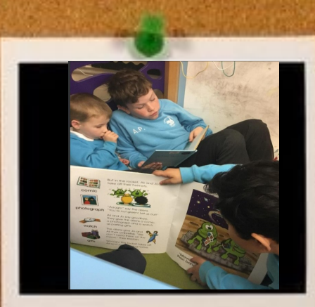
Personal, Social, Health and Economic Education

Our Reception children met their Y6 buddies.