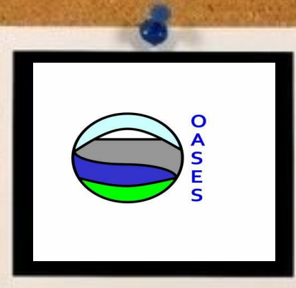
Careers Education, Information, Advice & Guidance

OASES (Outdoor and Sustainability Education Specialists) delivered a school assembly all about suggestions and ideas for saving energy in school. Afterwards, Year 5 enjoyed a follow up workshop.