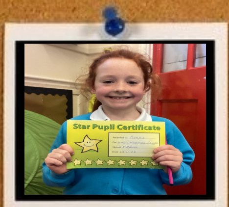
British Values & Community Links

Take a peep at our classroom doors. Our Cestria elves have been super busy!