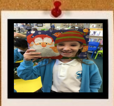
British Values & Community Links

We have had a lovely morning in the library sharing a story and taking 'elfies' and doing some Christmas craft which will be displayed for everyone to enjoy.