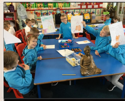
Spiritual, Moral, Social & Cultural

Abbey the Owl (from Discovery RE) is helping us to think about a special question... What can we find out about Buddha? Last week we thought of lots of great questions which we will solve over the next few weeks. Today we found out about his early life.