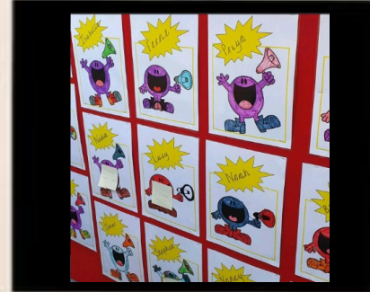
British Values - Democracy

We have been developing a democracy display in every classroom. Our children's views are very important and we want them to understand that they have an important role in decision making in their class.