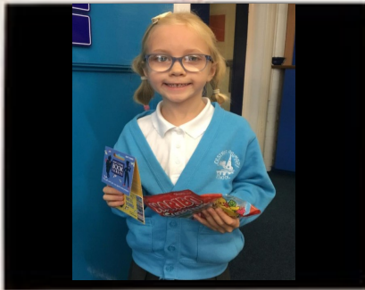
Spiritual, Moral, Social & Cultural