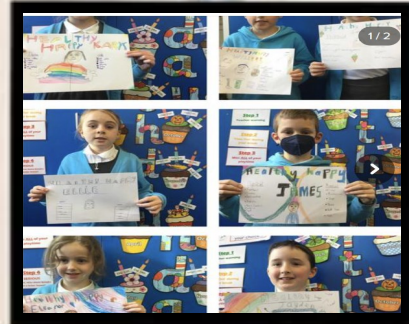
Personal, Social, Health & Economic Education.

Great work in PHSCE - Happy Healthy Children.