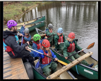
Physical Health & Active Lifestyles