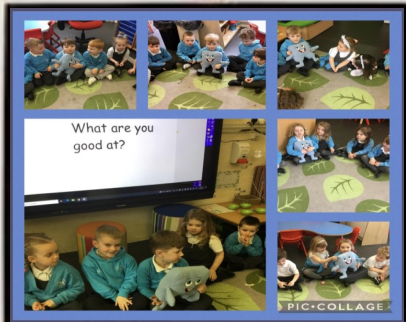
Personal, Social, Health and Economic Education