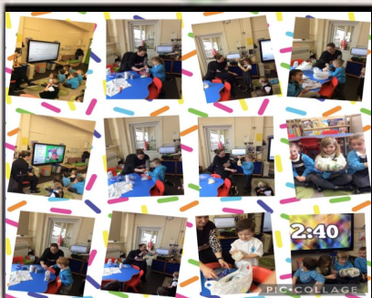
Careers Education, Information, Advice and Guidance

We are celebrating National science week. The children have been learning about famous inventors in this weeks assembly.