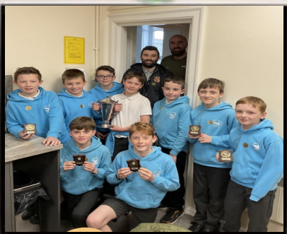
Physical Health & Active Lifestyles.

Our musical superstars performed at The Sage last night with Durham Music Service. We hear them rehearsing in school every week and we think they are brilliant.