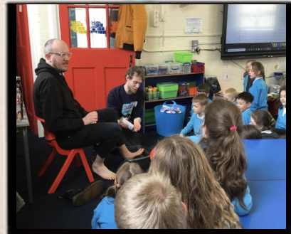
Personal, Social, Health & Economic Education.