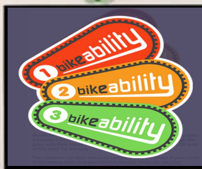
Physical Health and Active Lifestyles.

Year 6 have been learning vital 'bike ability' skills. They have the opportunity to gain new skills and techniques or even benefit from a refresher course of bike safety and how to apply them to everyday life outside of school.