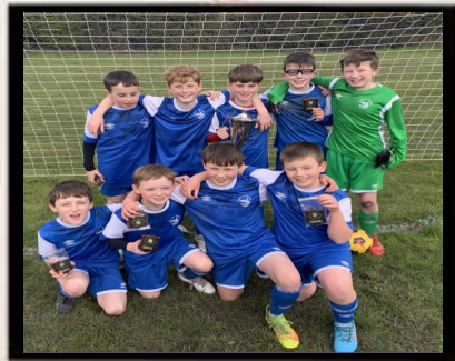
Physical Health and Active Lifestyles

The team are still in the County Cup after Easter and are also hunting league glory! They're an absolute joy to coach!