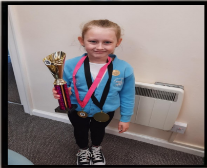
Physical Health & Active Lifestyles

This morning, Year 5 spent time with OASES staff who helped us take part in a tree planting activity at Picktree Lodge. We planted hazel, silver birch and holly trees which hopefully, in 30 years time, should be fully fledged trees.