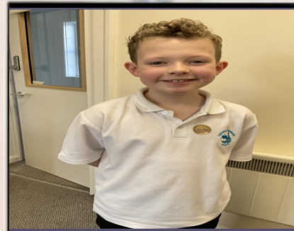
Physical Health and Active Lifestyles

Our Superstar swimmer has been ranked 7th in the whole of Great Britain for the 50m butterfly. What a fabulous achievement - we are so proud of you!