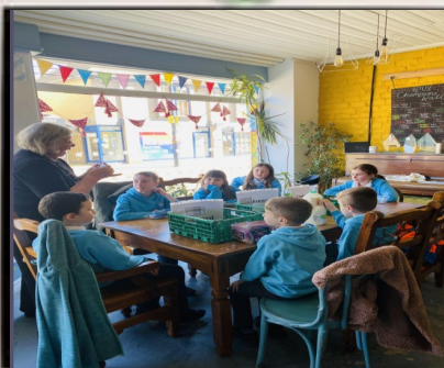
Careers Education, Information, Advice and Guidance

More trophies for our little cheerleader!