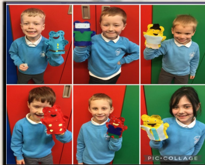
Mental Health & Wellbeing

Fabulous puppets made by the children in Art and Design Club this half term.