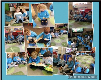
Careers Education, Information, Advice and Guidance

Little Moons and Little Stars have been talking about things we are good at.