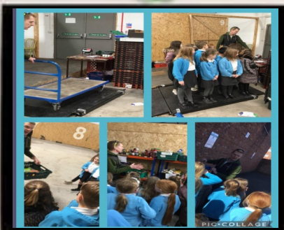
Careers Education, Information, Advice and Guidance

A lovely trip out to the library this morning. We shared a story then showed amazing teamwork building models from Lego.