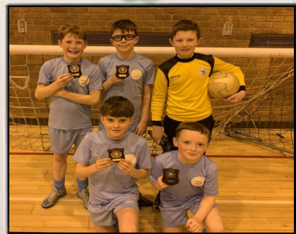
Physical Health and Active Lifestyles

Well done to the 5 a side football team who finished 2nd in the county. Winning 2 out of their 3 games.