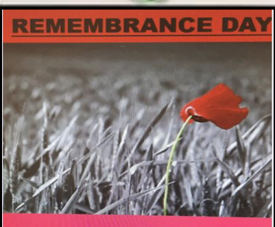
Protected Characteristics & British Values

A very special letter received arrived in the post. Not every day you get a letter from the King and Queen!