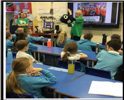
Mental Health & Wellbeing

We were joined in school by members of the NSPCC who discussed with us the rights that we have as children, what we can do with any worries we might have and who we can speak to.