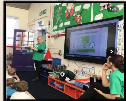
Mental Health & Wellbeing

Today the children had a visit from the NSPCC and were excited to meet Buddy who had a special message Speak out Stay Safe.