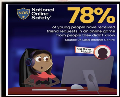
Mental health and Wellbeing