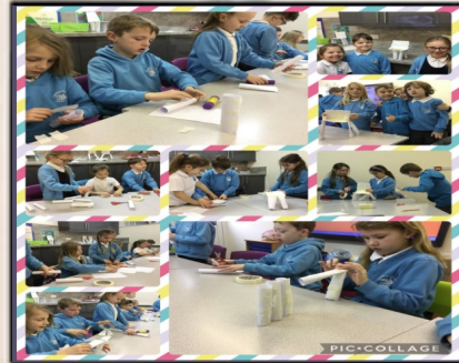
Careers Education, Information, Advice and Guidance

In DT we made structures using paper and tape. The children worked in small groups. Their challenge was to make 9 cylinder shapes between them and then attach them to make a chair