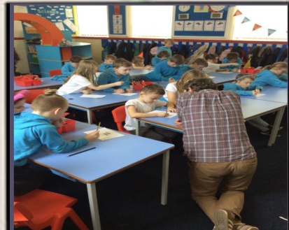
Spiritual and Moral and cultural Education.