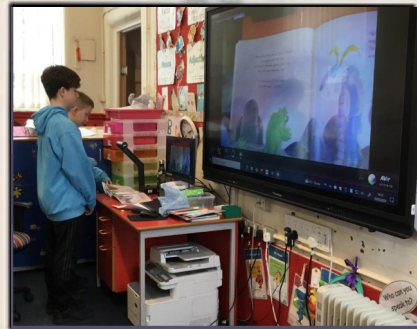
Online Safety - Mental Health & Wellbeing

Thank you to year 6 boys who came to read a story to us about keeping safe online.