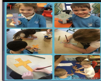
Spiritual, Moral and Cultural Education

Across the school, we designed a cross to be displayed in Mary's and St. Cuthbert's church. One side was filled with things that we love and that make us happy. Then, we discussed some things that we would like to change about the world. We talked about people being unkind, littering, and how some people are less fortunate than us. We spoke about what we could all do to make the world a better place and the little changes we could all make. We came up with recycling, being kind, and giving to charities, and we drew this on the other side of the cross.