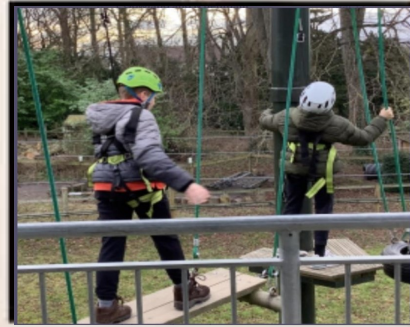
Physical Health & Active Lifestyles

Our Y5 children have spent the last 3 days on an exciting residential at Robinwood Activity Centre...they have had loads of fun and challenged themselves in all sorts of ways...they have been simply amazing. Thank you to all the staff who accompanied the children, I know they have had an amazing time too.