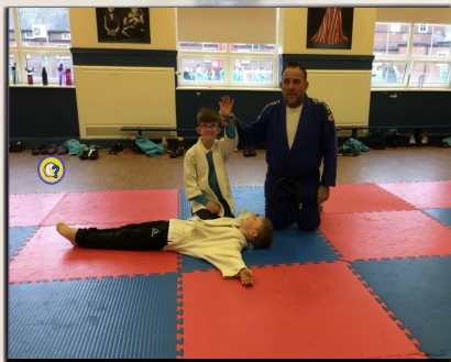
Physical Health & Active Lifestyle

In this week's book based assembly all the classes will be thinking about our environment and climate change!