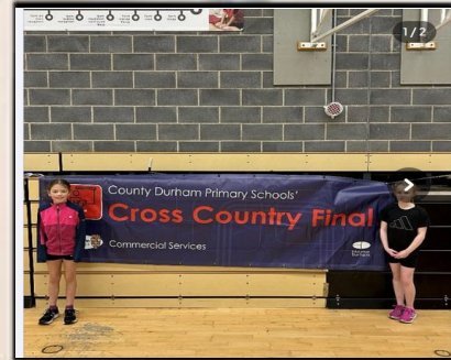
Physical Health & Active Lifestyles

Very successful county cross country for the Cestria girls this morning: We are so proud of you!