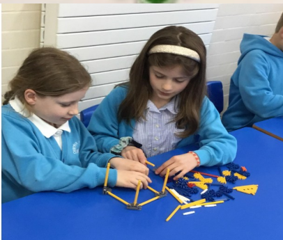
CEIAG - Careers Information