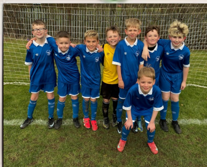
Physical Health & Active Lifestyle

There were some brilliant individual performances from our other runners and the behaviour of those involved was exceptional.