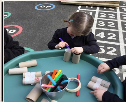
Personal, Moral and Cultural Education

We have designed and made our very own binoculars. We used them to try and spot birds and worms in the wormery.