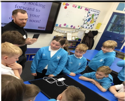
CEIAG - Careers Information

Identifying angles - right angles, obtuse and acute. Ask us which is which!