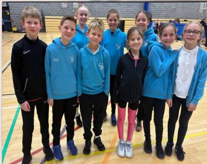
Physical Health & Active Lifestyles

The team played fantastic and it was brilliant to see both the goals coming from Cestria players.