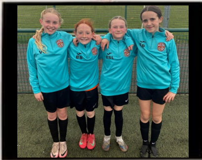
Physical Health & Active Lifestyles