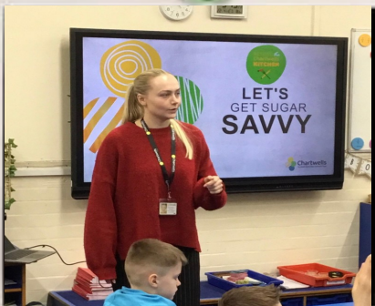
Physical Health & Active Lifestyles

Our shed can be found outside the main office. Children are welcome to borrow a book to read from the shed. We would also be happy to accept a book in return, please place these on the top shelf for our year 6 reading helpers to sort into the right box.