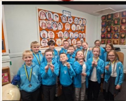
Physical Health & Active Lifestyles