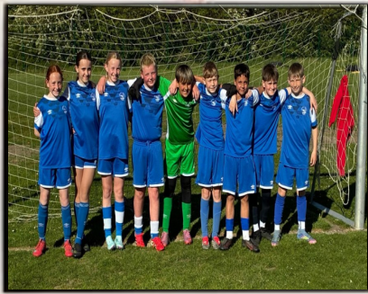
Physical Health & Active Lifestyles