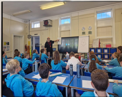
Mental Health & Wellbeing

Continuing with our DT work, we used last lesson's research to code and create our mini temperature sensors! We even added a sound alert to each one... which was enjoyable for everyone involved.