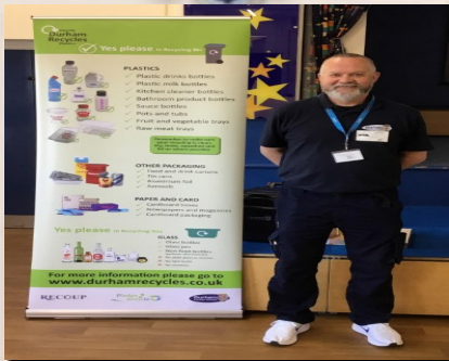
CEIAG Careers Education, Information, Advice and Guidance

CRANK IT UP! Last week we embarked on their crane model for the Beamish Engineering project. Super team work and some amazing ideas.