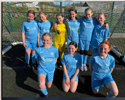
Physical Health & Active Lifestyles

For the first time in over 10 years, Cestria's school football team have won the Chester-Le-Steet School Football League. They needed to win all 3 games to complete the job and they delivered, beating Red Rose 5-0, C of E 2-0 and winning the final game against Lumley 1-0 in the dying minutes. We are extremely proud of the skill and resilience shown by this team and they deserve this moment.