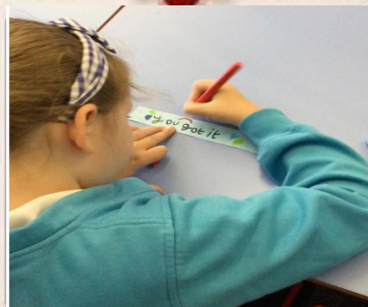
Mental Health & Wellbeing

Today is our last session of our wellbeing workshops on friendship. To complete some of the lovely work we've done, we created a positivity paper chain contains words and phrases we've talked about over the last few weeks.